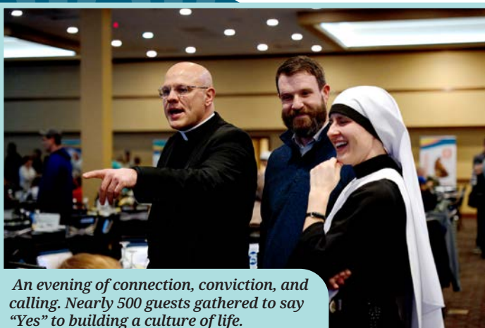
An evening of connection, conviction, and calling. Nearly 500 guests gathered to say "Yes" to building a culture of life.